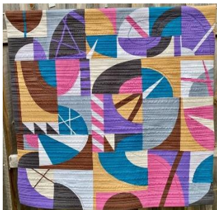
Down The Rabbit Hole