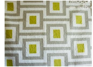
vintagemodernquilts Midcentury Quilt pattern blogged here

Can you believe that September is almost over? Crops are being harvested and are giving me design ideas! We will continue to watch and follow any guidelines for the pandemic to keep our members healthy but engaged. Last month we did our first dual meeting – in person and via zoom. Feedback from zoom participants said that it went well, so we will continue trying to do the dual option even though our speaker will be in person this month.