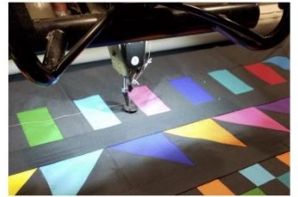
Services provided by people and businesses. Please contact them directly.

Do you have a service to promote to quilters? As a BNMQG member, you get a very low rate to advertise on our website in the classified advertising tab. You provide an image (business card), a link, an application, and payment. We do the rest! Applications will be available at the Guild meeting!