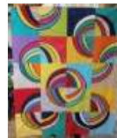
Pattern without sashing or border and with optional fusible bias tape