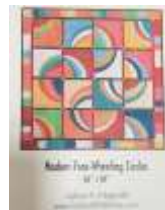
Original quilt pattern

The April 4 th workshop will be rescheduled – After a lot of interest, I will give one on the Free Wheeling Circle Quilt by Gyleen Fitzgerald. This is a really fun and fast quilt to make so start pulling your solids or fabrics that read like solids. The cost is $35 and includes the pattern, The supply list can be found on FB in the file section of BNMQG. Extra patterns will be available for sale after the workshop if you are unable to attend.