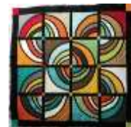
Original pattern with sashing, no border, and optional fusible bias tape

The July 25 th workshop will be a bag making class given by Pat Messinger – the Compass Bag. Sign up will begin in May.