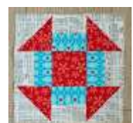
Figure 1: Traditional Churn Dash